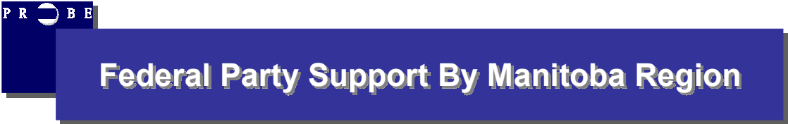
“Thinking about Federal politics now, as you may have heard, a federal election will be held on October 14th. Which party’s candidate would you be most likely to support?” (n=1,000)

As the following graph reveals, the Conservatives continue to enjoy massive support beyond the Perimeter Highway, although they enjoy only a slightly less impressive lead over their New Democrat and Liberal rivals within Winnipeg. The Conservatives are the top choice of 40 percent of Winnipeg residents, while the New Democrats and Liberals are tied within the city (at 26% and 27% respectively) and the Greens stand at seven percent. Outside Winnipeg, a massive 52 percent of decided voters support the Conservatives, while 24 percent back the NDP, 17 percent plan to vote Liberal and five percent support the Green Party.